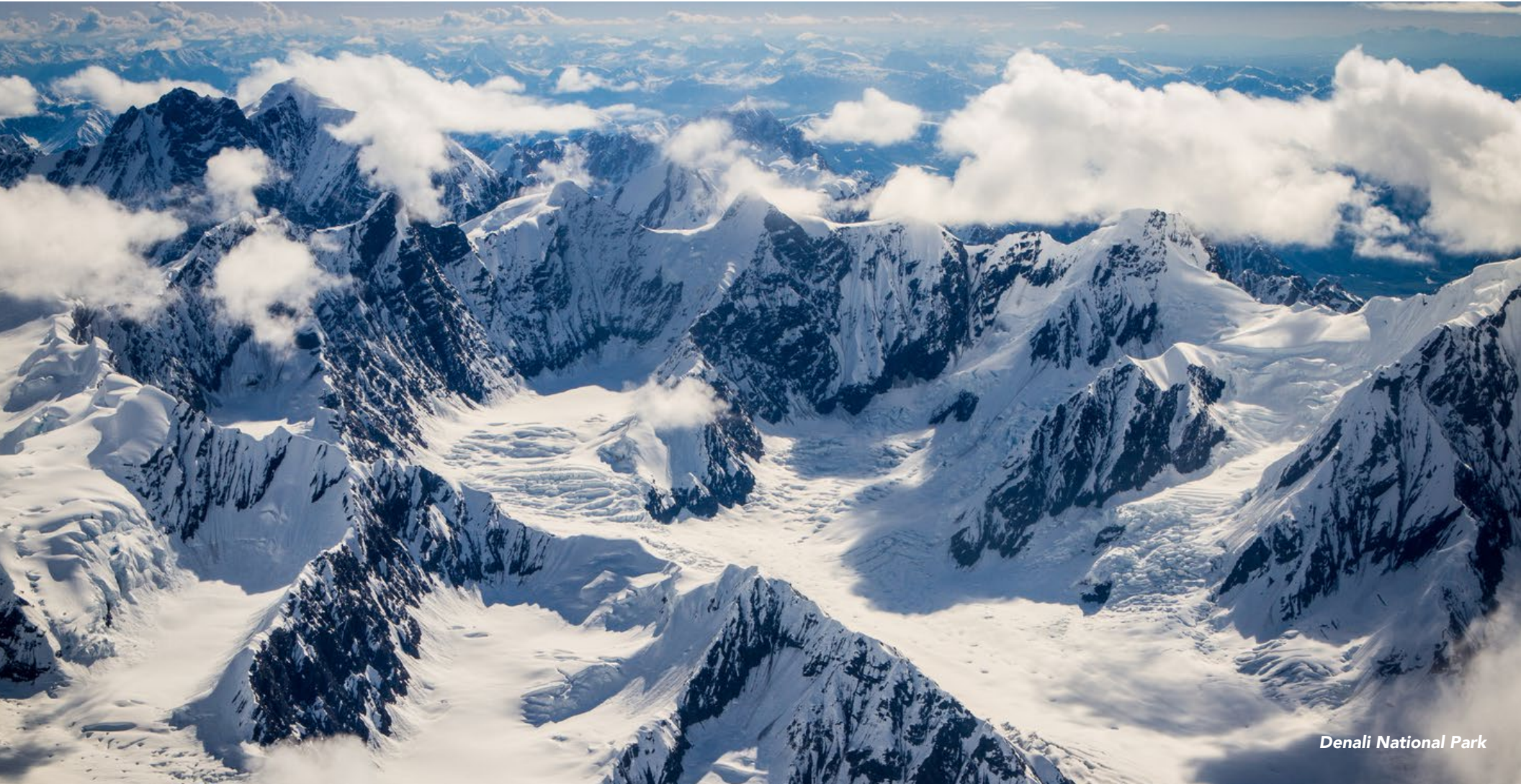
Denali National Park

For more trip inspiration and travel ideas throughout the USA, go to: VisitTheUSA.com