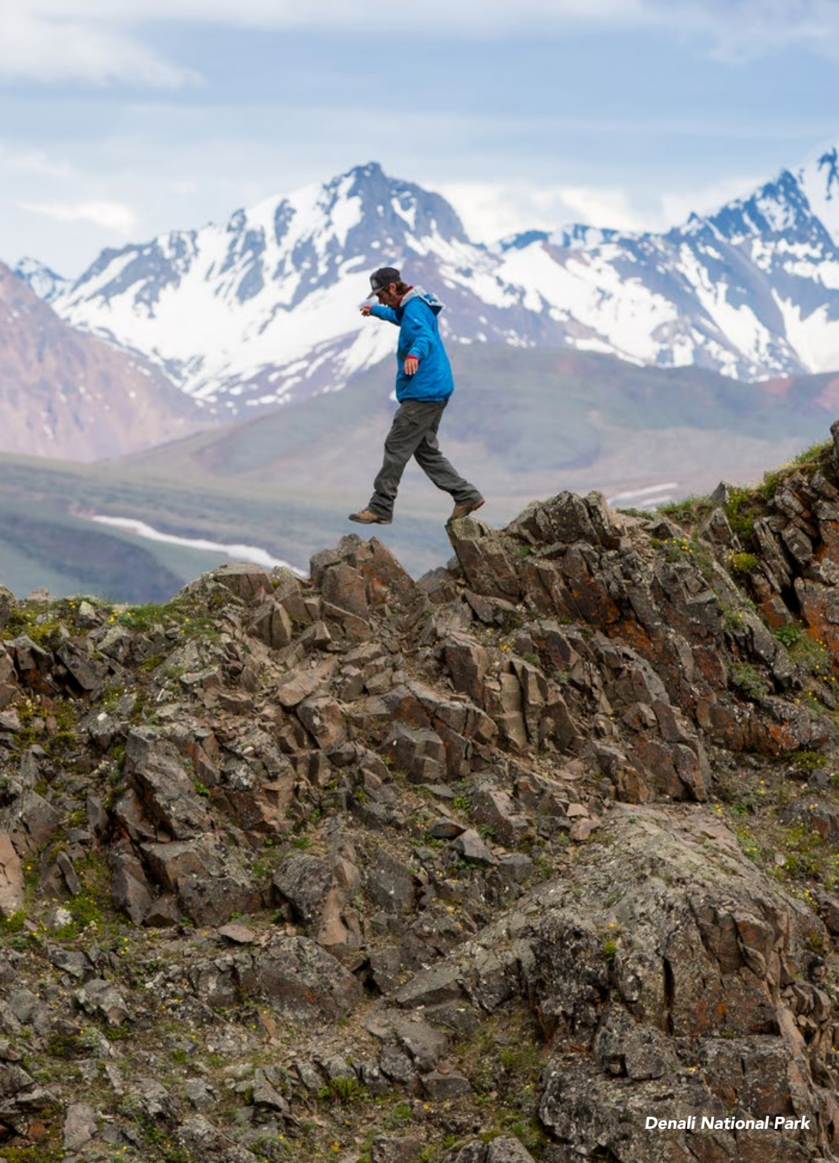
Denali National Park