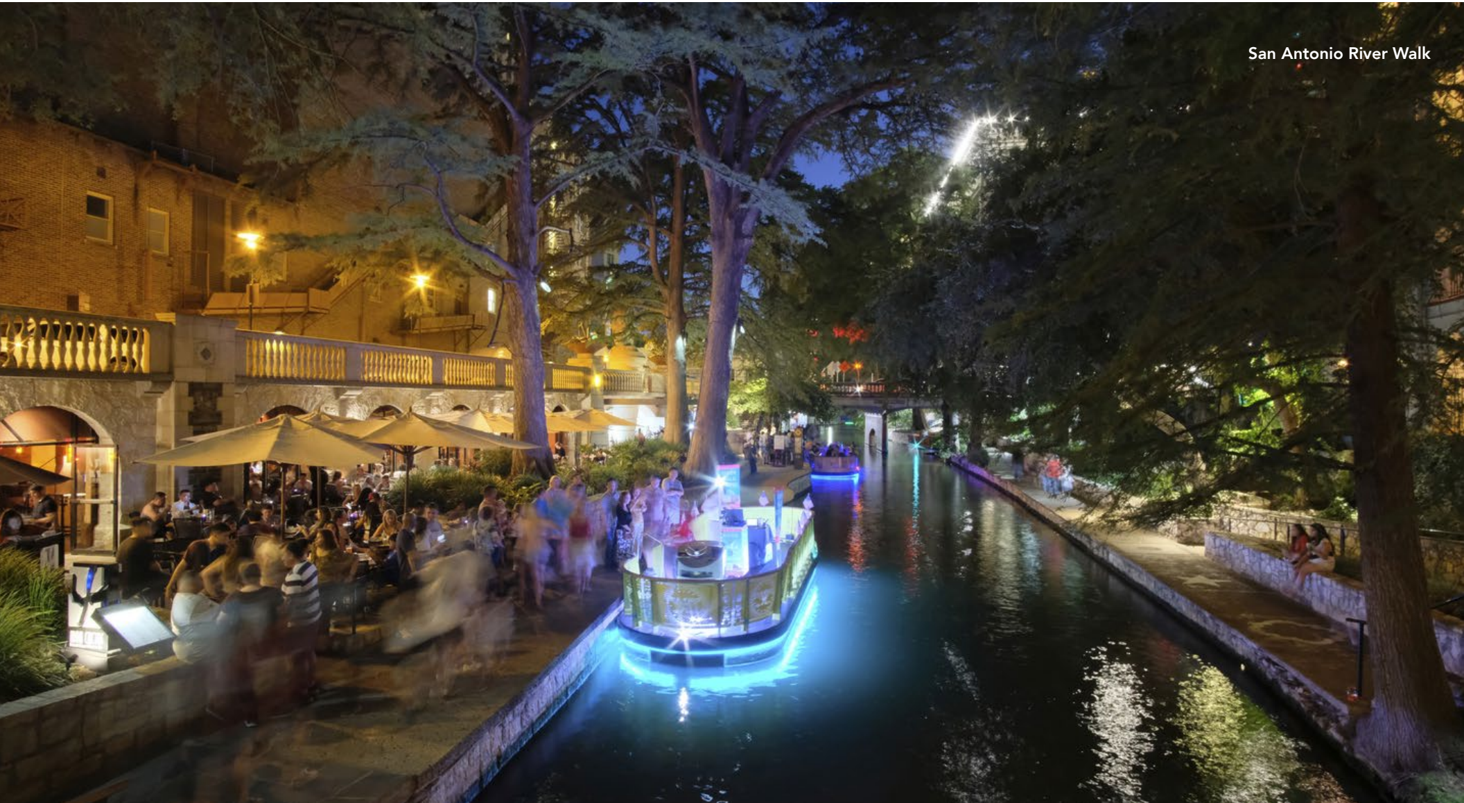
San Antonio River Walk