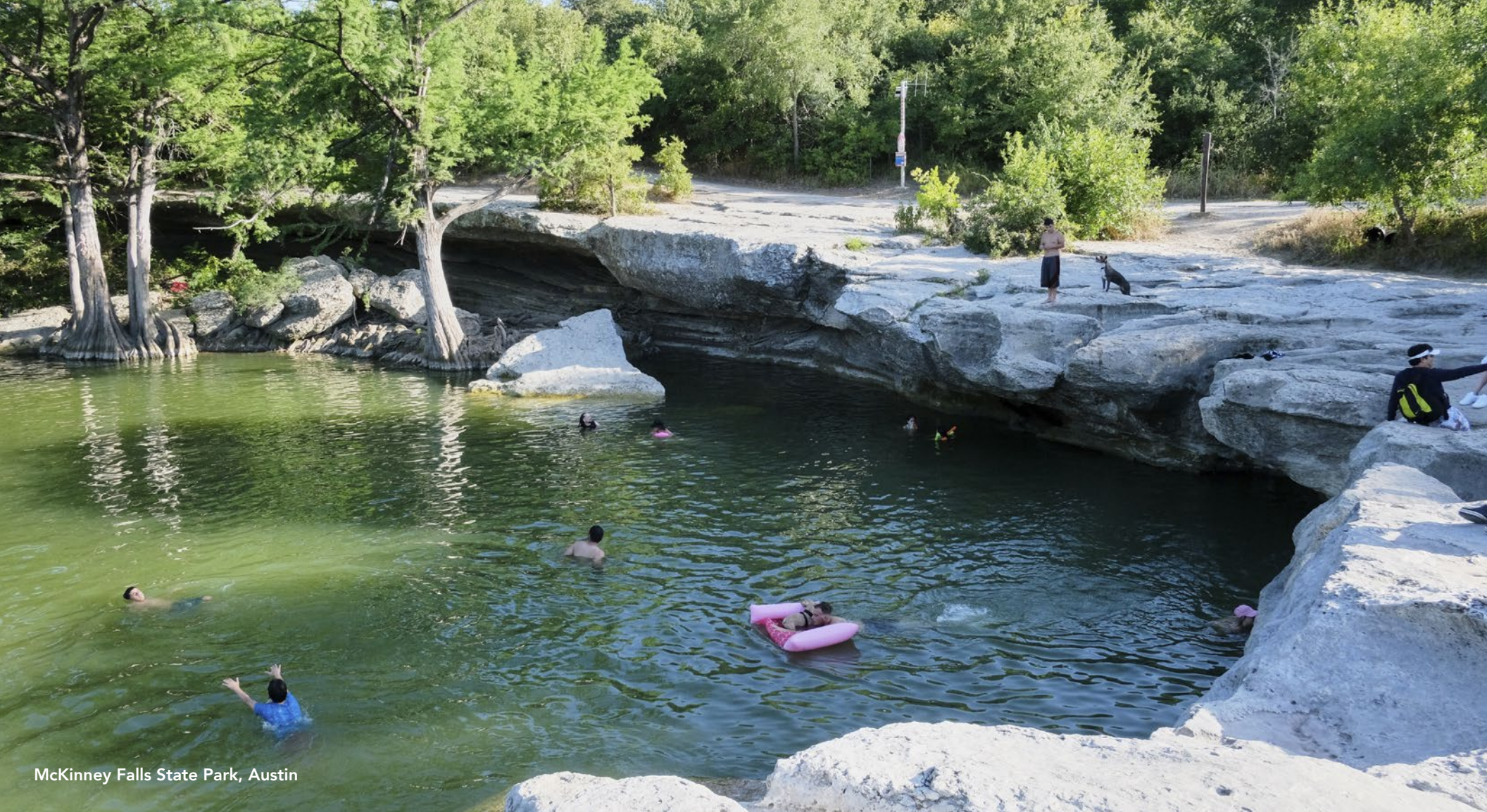
McKinney Falls State Park, Austin