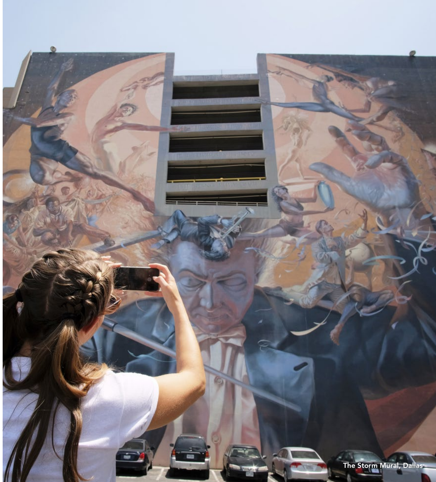
The Storm Mural, Dallas