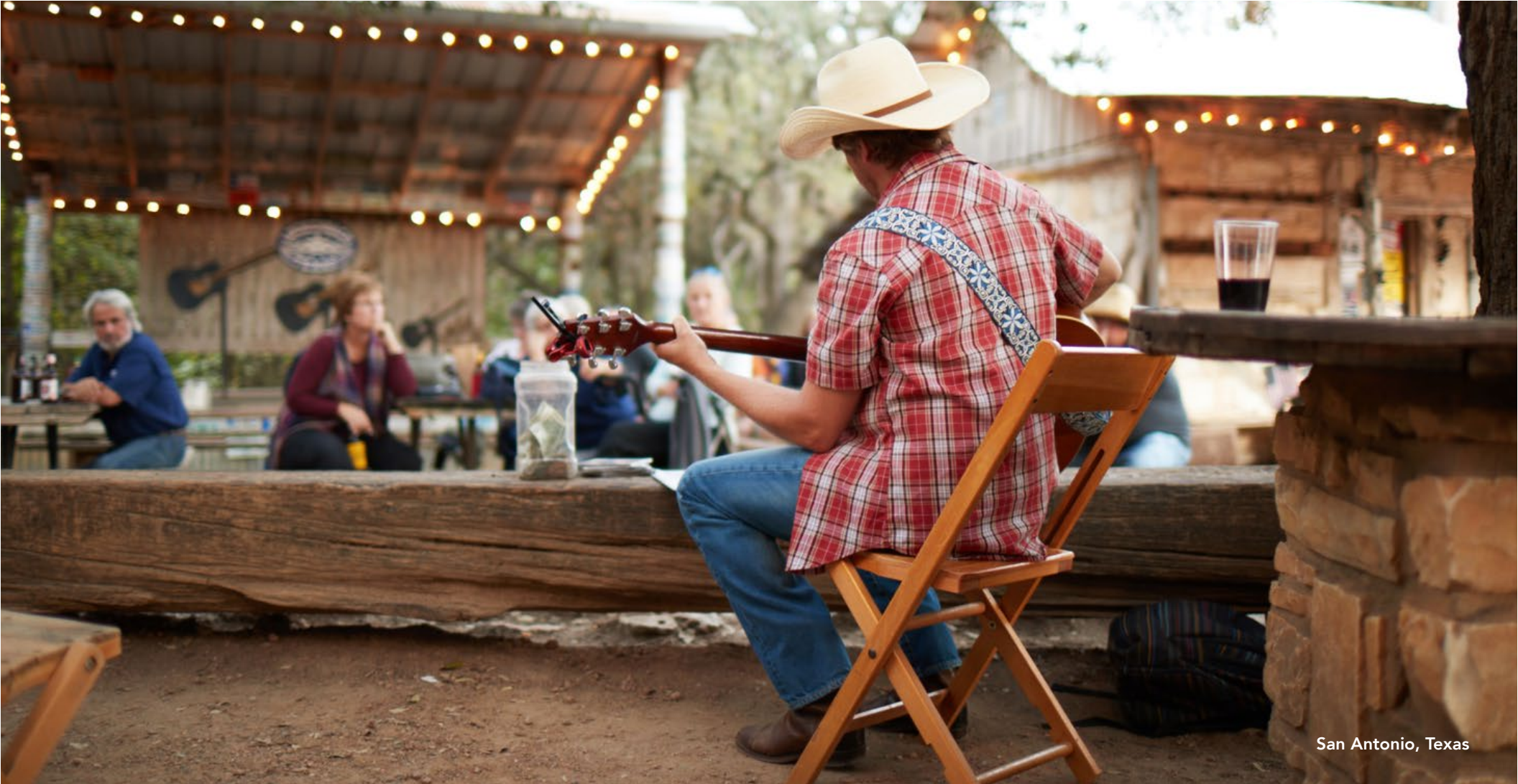
San Antonio, Texas

For more trip inspiration and travel ideas throughout the USA, go to: VisitTheUSA.com