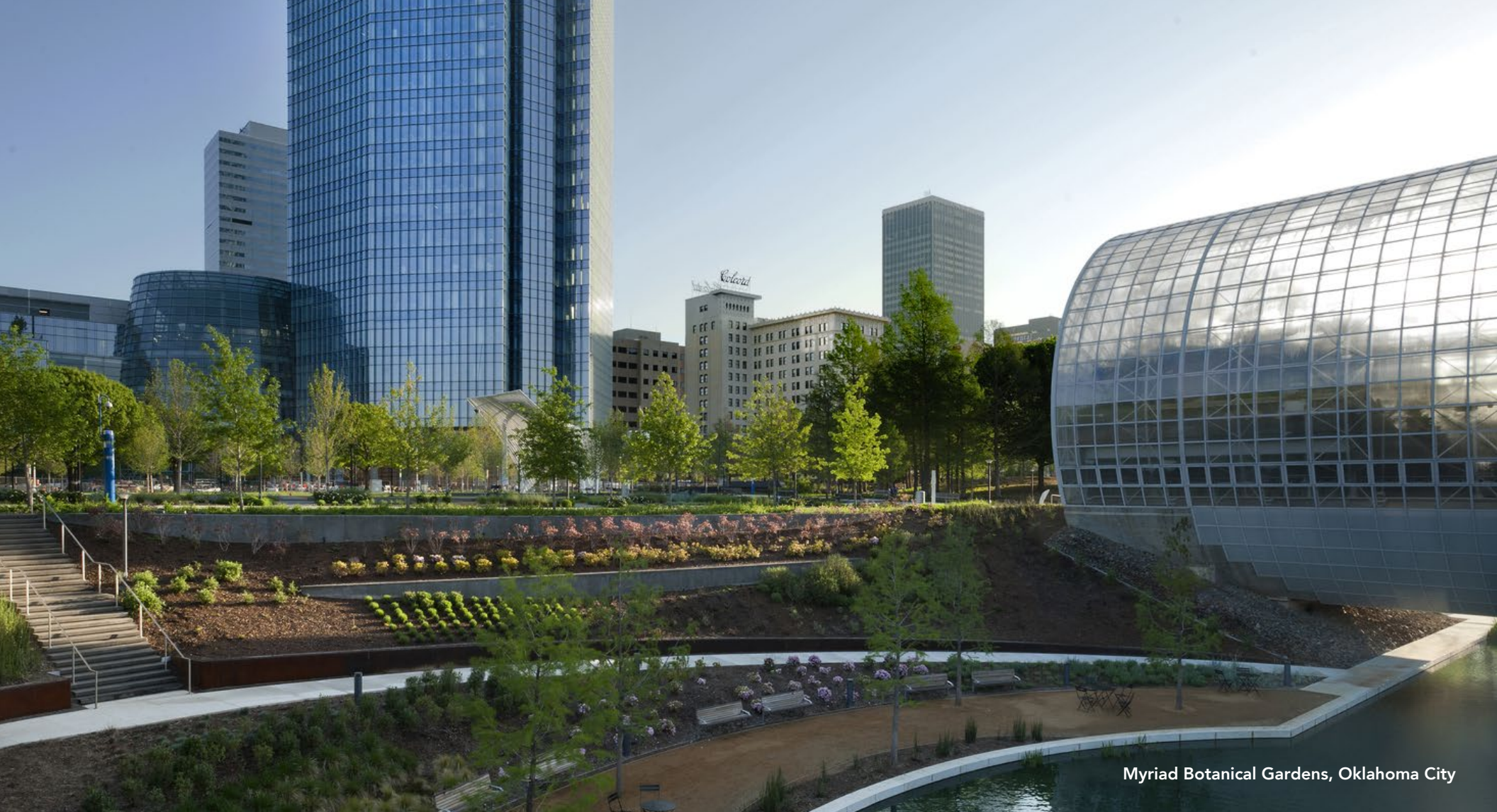
Myriad Botanical Gardens, Oklahoma City