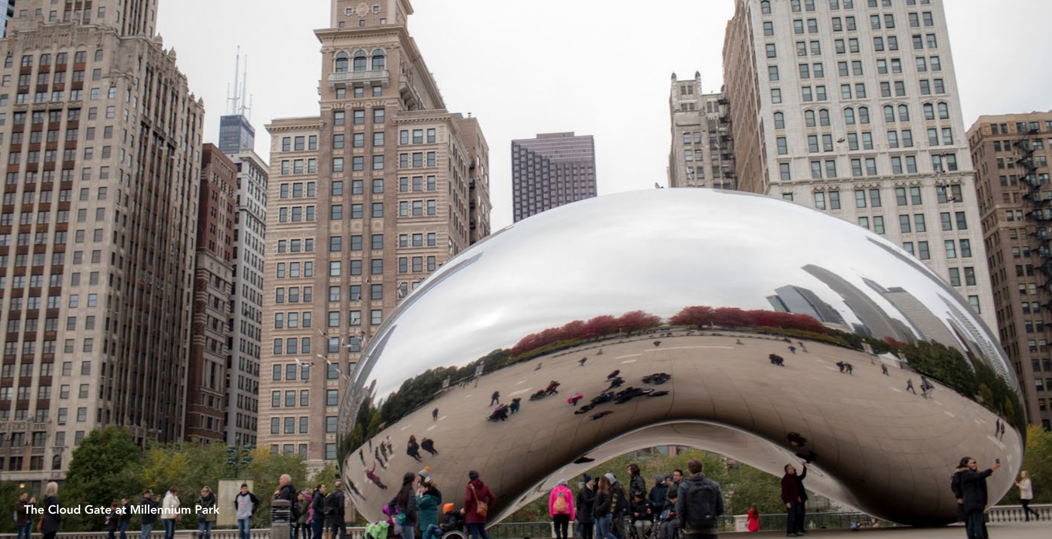
The Cloud Gate at Millennium Park