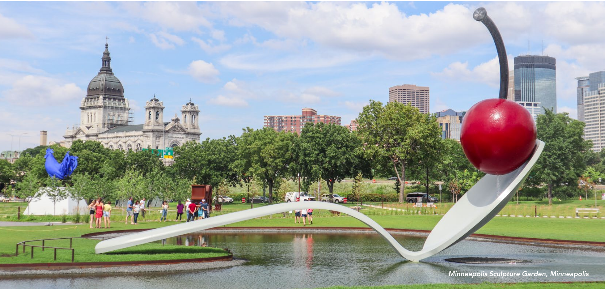
Minneapolis Sculpture Garden, Minneapolis