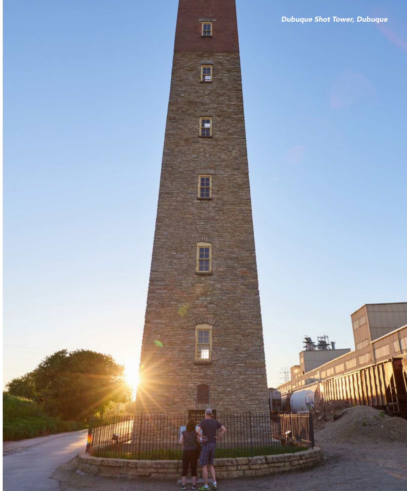
Dubuque Shot Tower, Dubuque